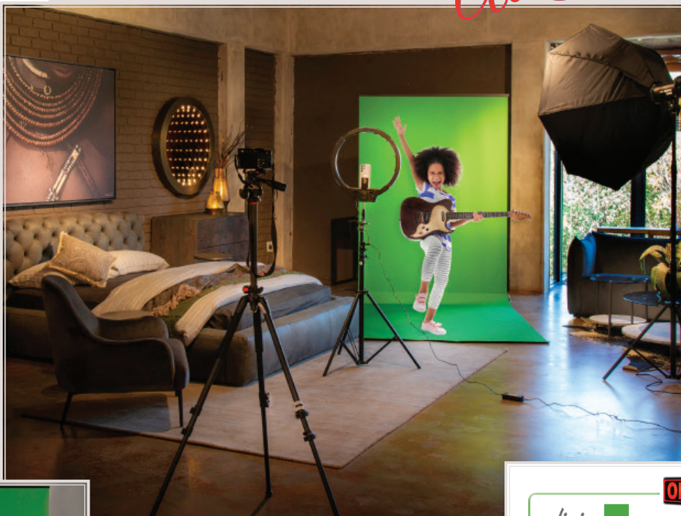
Digi VIDEO Kit / 1,5m x 2m(h) with detachable infinity curve Groundsheet