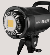
Best VIDEO Light with 120cm Octabox and quality Light Stand.