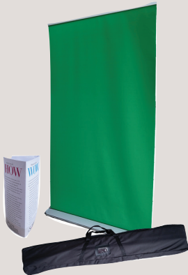
Digi OFFICE Kit : 1,5m x 2m tall