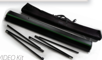
The compact Digi VIDEO Kit