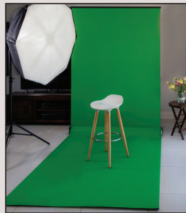
Digi VIDEO Kit : 1,5m x 2m tall, with unique detachable roll-out Infinity Curve. Full length, Body Language and Live Streaming.